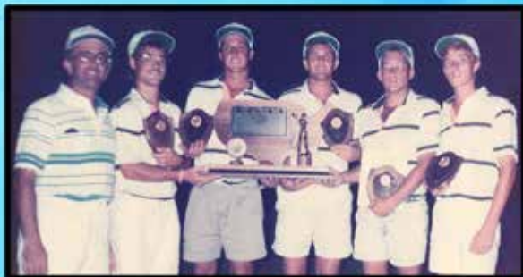
1990 CATAWBA VALLEY COMMUNITY COLLEGE NATIONAL CHAMPIONSHIP GOLF TEAM

INDUCTION CEREMONY: MONDAY, MAY 15 HIGHLAND RECREATION CENTER